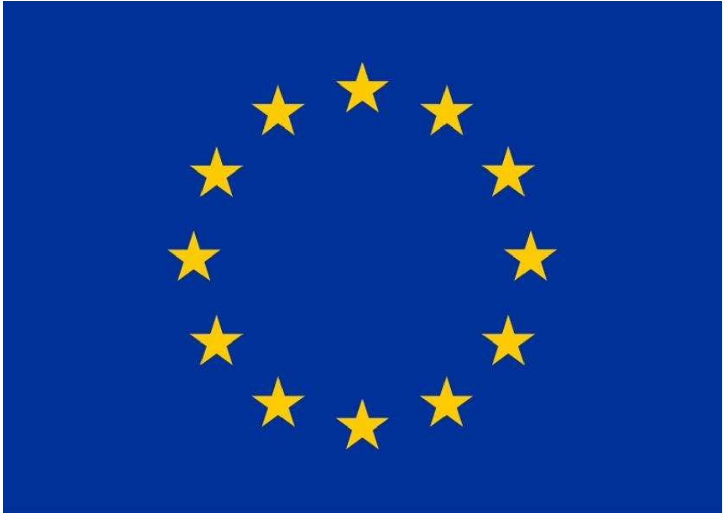
EU flag